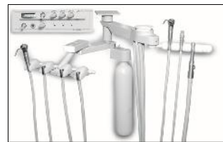
MC2180 CONTROL AND VACUUM WITH EXTRA HVE 6-PIN FIBER OPTICS WITH ROUTING VALVE 1115-315-CS