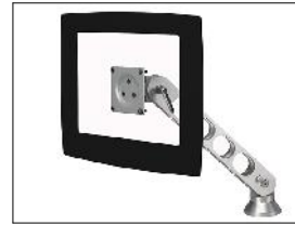
RXDMY000S MONITOR MOUNT (MOUNT ON TOP OF BOX)